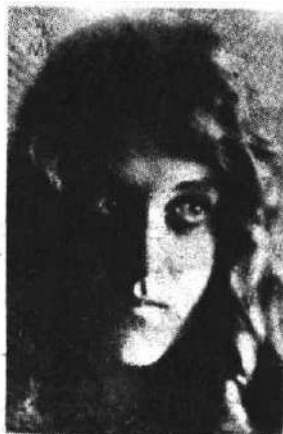
Ella Hall Movie star