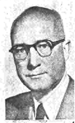
Tues., July 26, 1983

In 1971, then-state Sen. Bob Lagomarsino pushed a special bill through the Legisla-